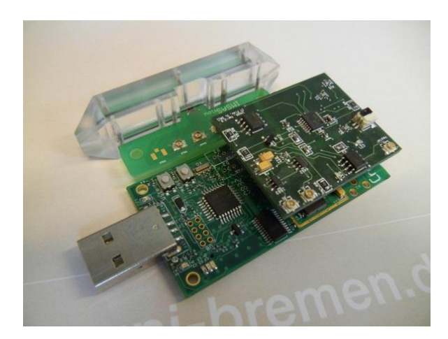
Figure 3: Prototype of the used hardware

Temperature models for containers carrying perishable goods are already available. In addition, the wireless platforms developed above can measure temperature as well. The spatial airflow profiles will be statistically analyzed along side the new and old temperature spatial profiles. The expected result is the evidence of how hindered ventialtion gives in to increased temperature air pockets.