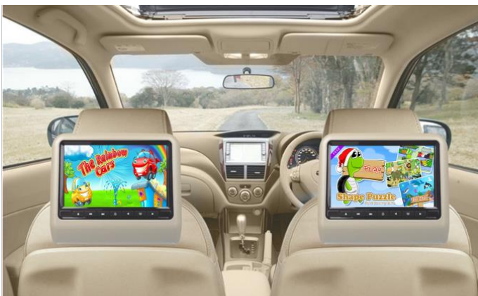
Dynamic Application: Online Gaming

The non-safety applications are expected to create commercial opportunities by increasing the number of vehicles equipped with on-board wireless devices. Comfort and infotainment applications aim to provide the traveler with information support and entertainment to make the journey more pleasant. It can also be employed to provide connectivity to catastrophe hit areas or remote rural communities lacking a conventional communication infrastructure. Here the benefit from the deployment of a vehicular network is to provide support for communication in humanitarian logistics, e.g., between rescue teams or other emergency services, or enabling non-real time services such as file-transfer or electronic mail. Our proposed protocol will help to improve both types of vehicular applications. The path selection on MAC layer will allow reliable message delivery to the neighboring vehicles, and shortest path selection between sources and destinations will improve information dissemination and interactive applications.